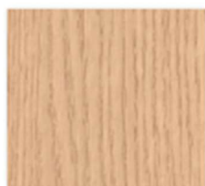
D1 - Whitened oak