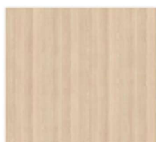
D3 - Sand Ash