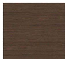
D4 - Dark walnut