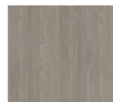
D5 - Grey wood