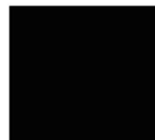
A - Black