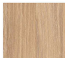
D2 - Amber oak