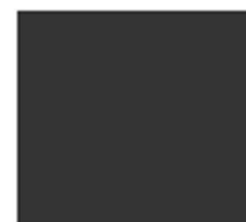
N1 - Dark grey