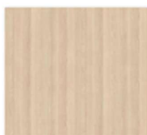
D3 - Sand Ash