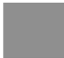
M - Metallic