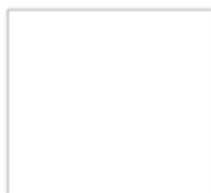
E - White