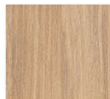
D2 - Amber oak