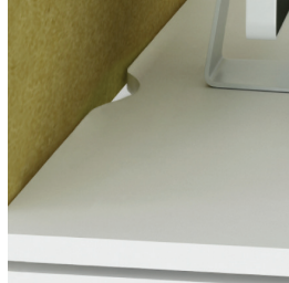
Desktops with a scallop for wire management