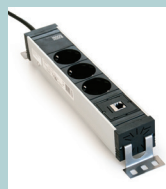
Power socket blocks