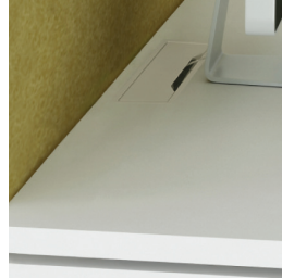
Desktops with a cut-out for grommet and wire management